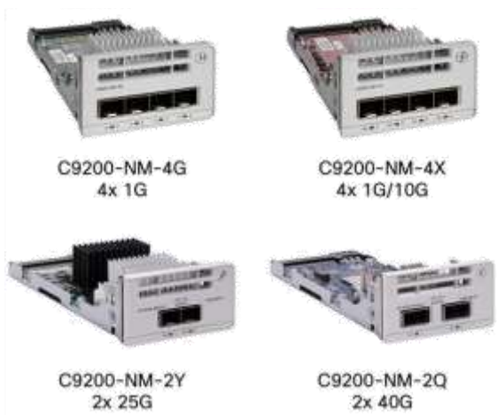
Figure 2. Cisco Catalyst 9200 Series Switch network modules

Cisco Catalyst 9200 Series switches come with modular or fixed uplinks as indicated in Table 1. With modular SKUs, the field-replaceable network modules provide infrastructure investment protection by allowing a nondisruptive migration from 1G to 10G and beyond. When you purchase the switch, you can choose from the network modules described in Table 3.